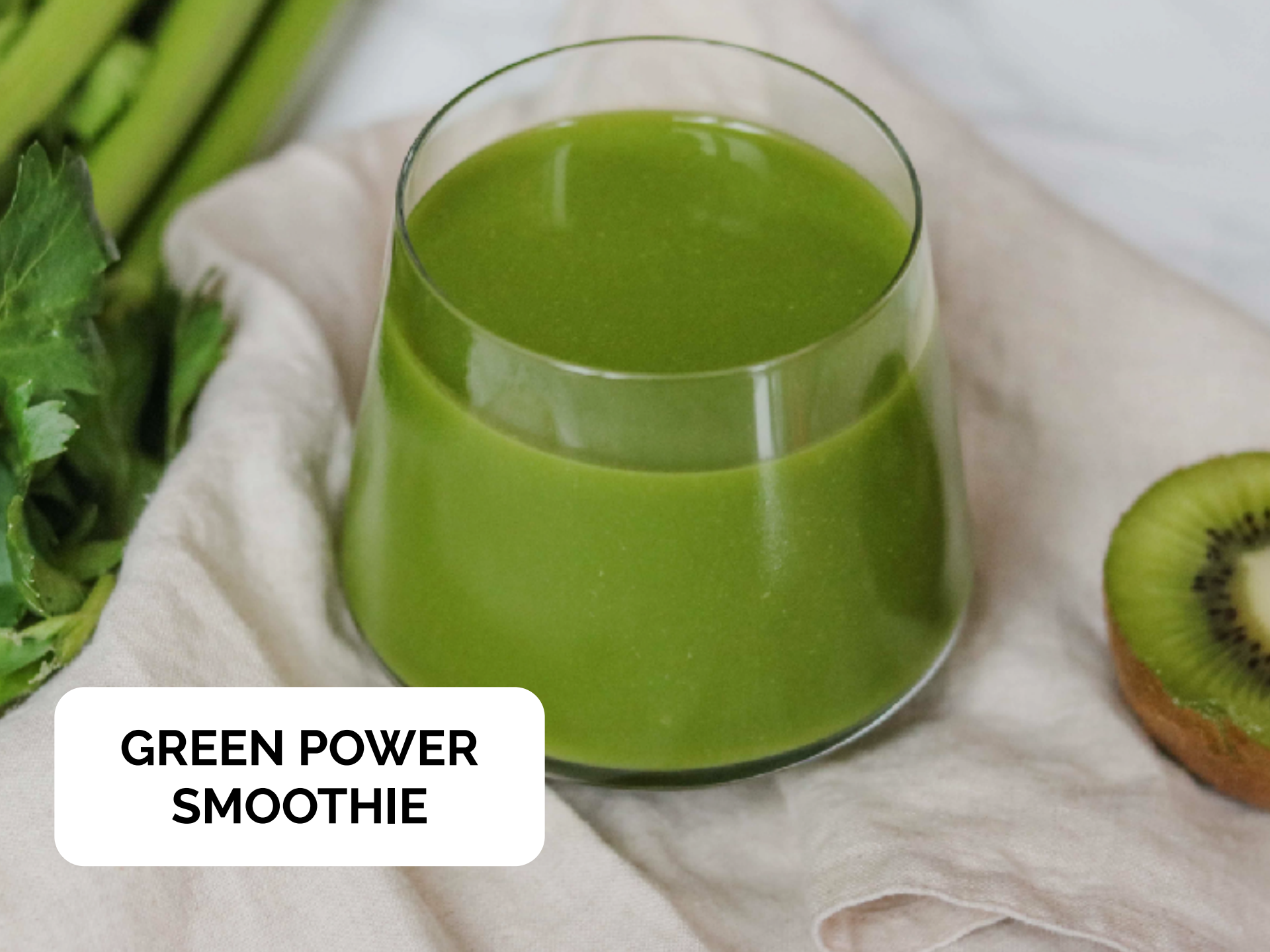
GREEN POWER SMOOTHIE