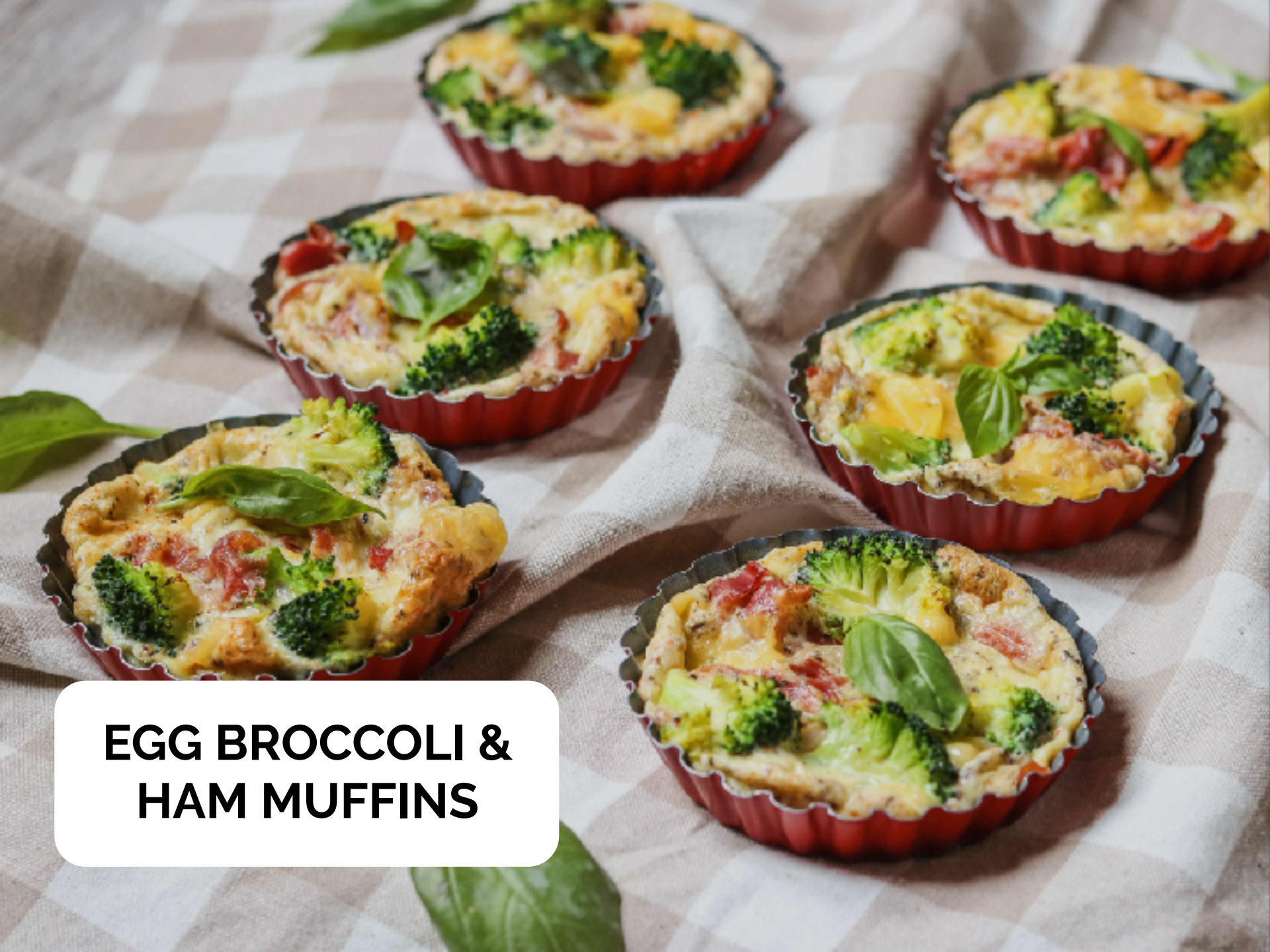
EGG BROCCOLI & HAM MUFFINS