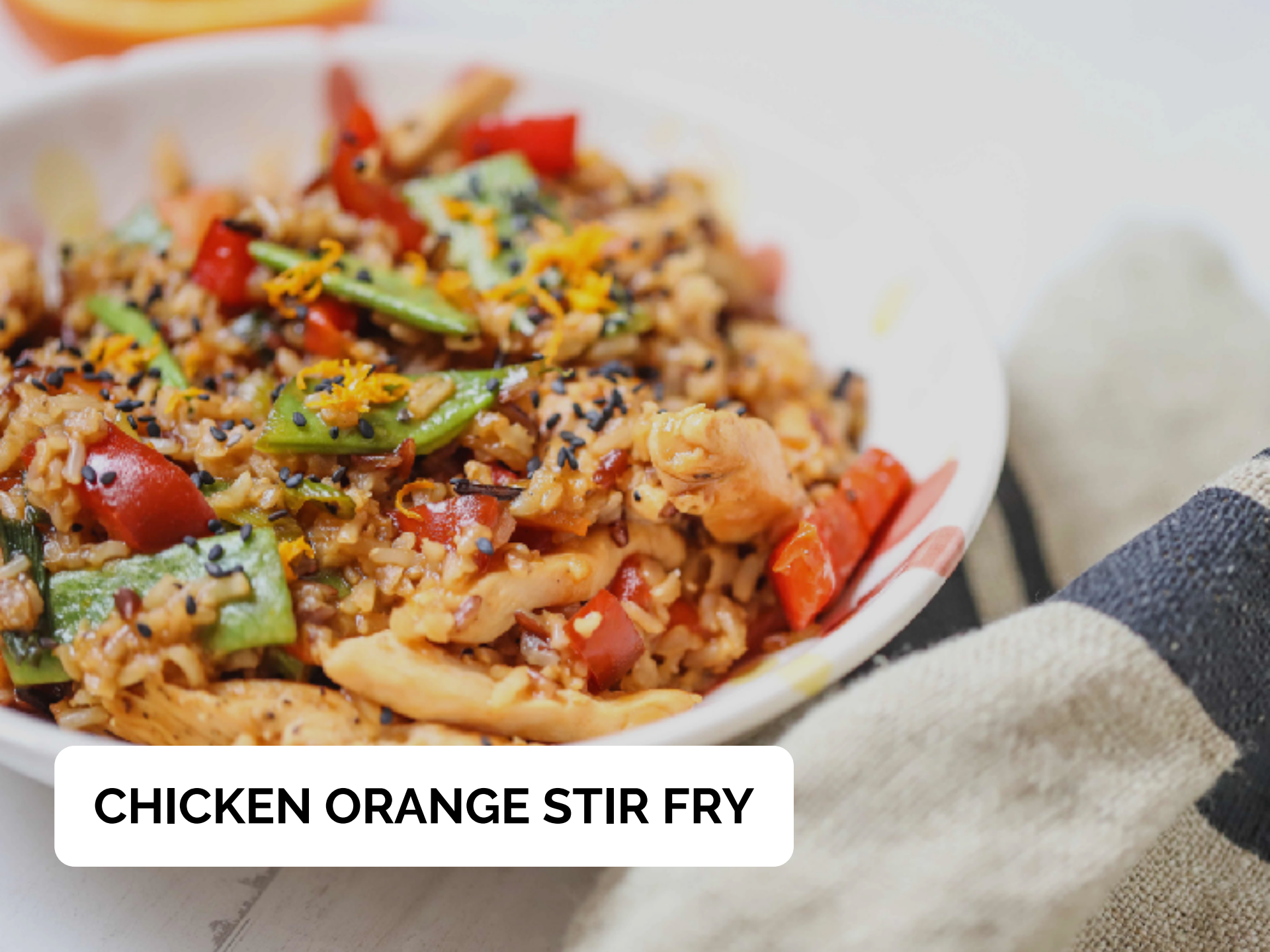
CHICKEN ORANGE STIR FRY