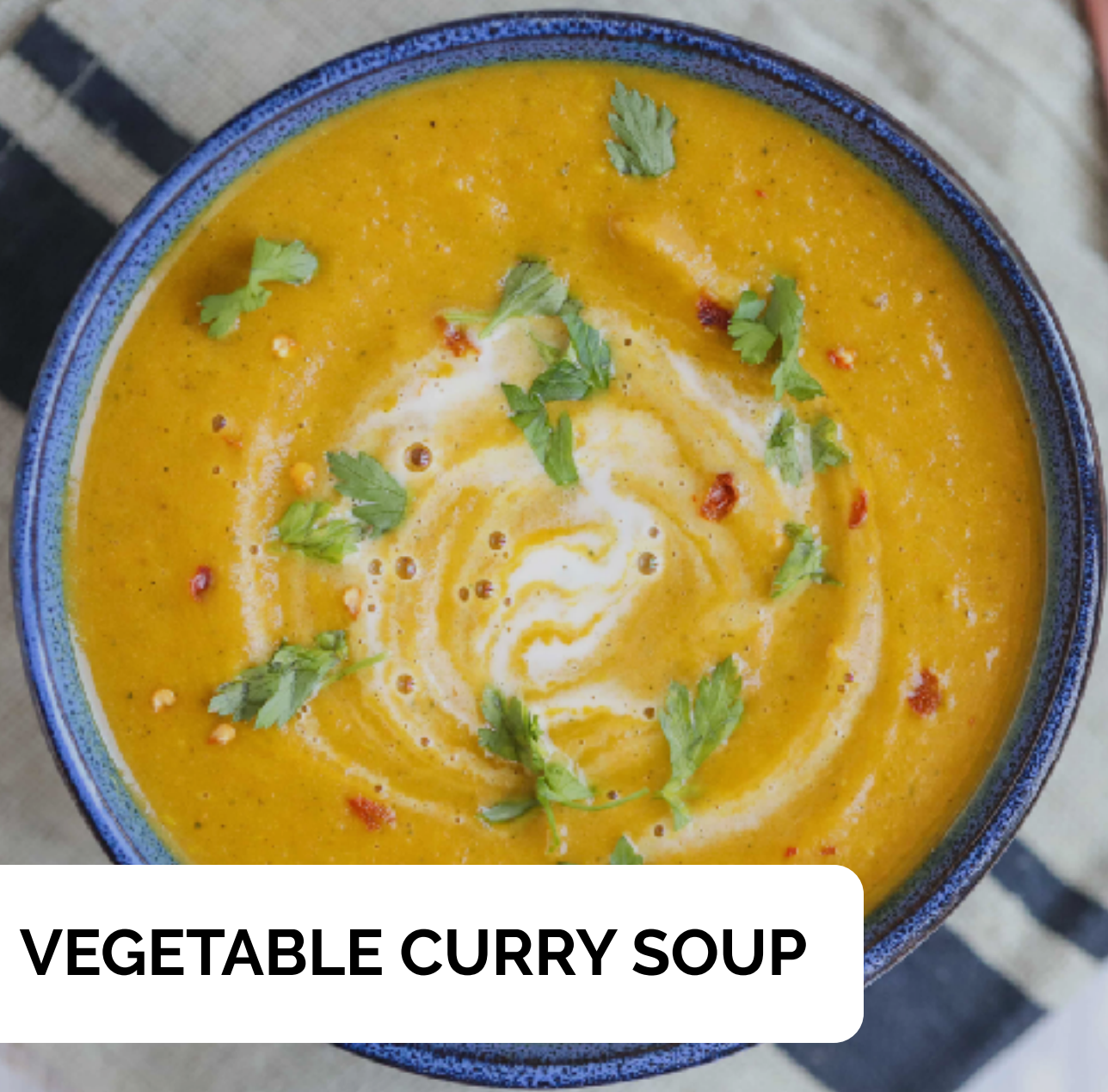
VEGETABLE CURRY SOUP