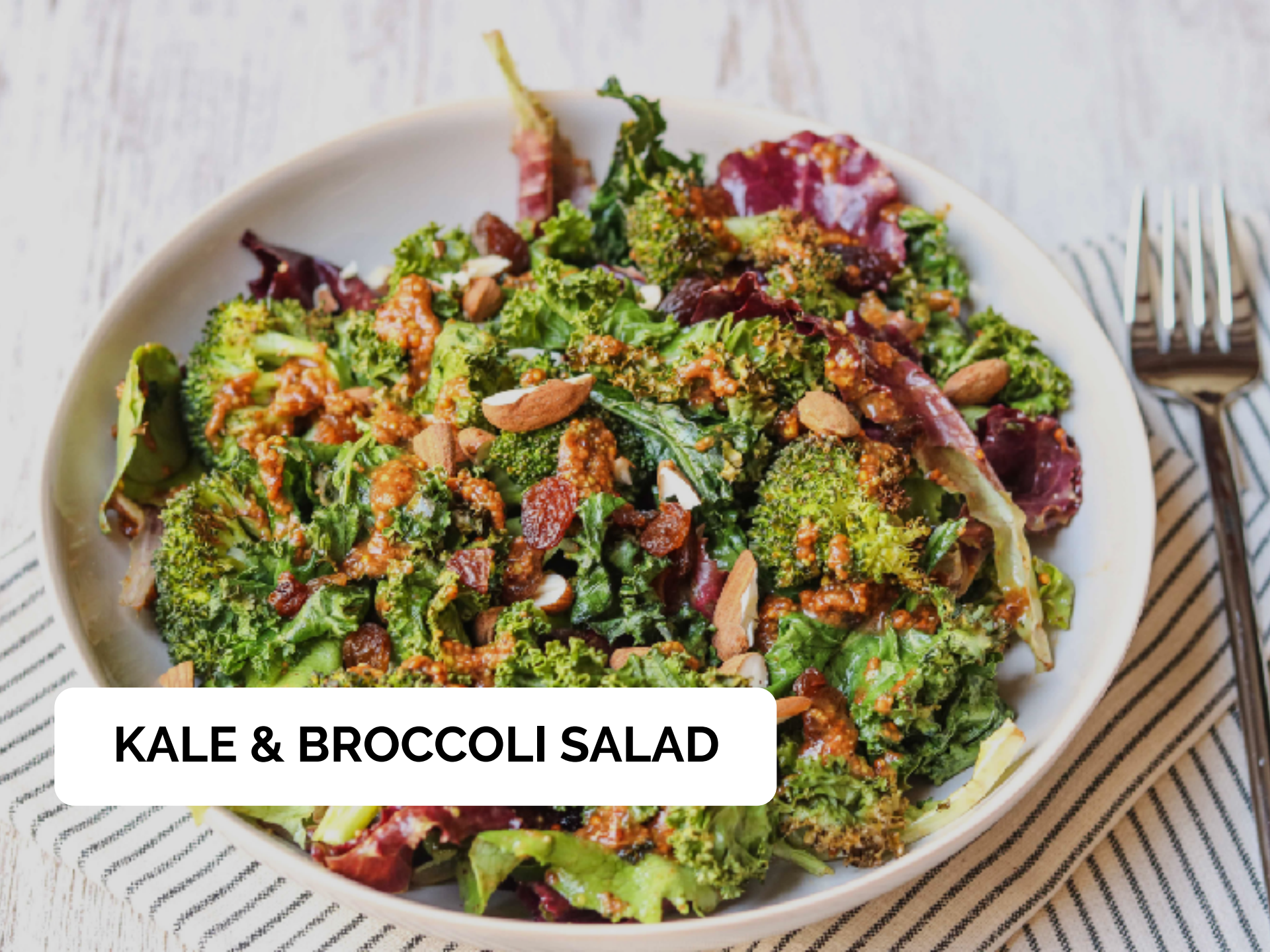
KALE & BROCCOLI SALAD